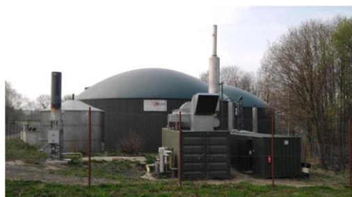
A biogas plant where the new technology was tested in a pilot-scale