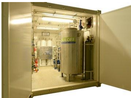
Technology for biomethane production